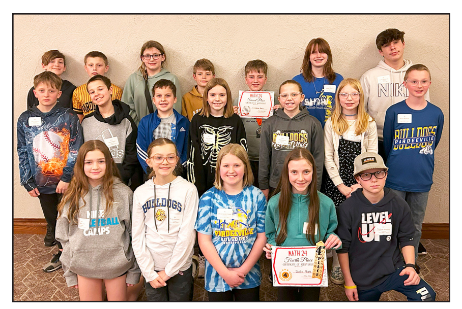
This group of students represented Pardeeville at the Math 24 competition held in Wisconsin Dells on March 11.