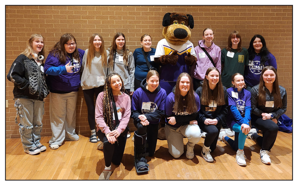
Pardeeville Middle School girls pose for a photo while attending the STEAM Women in Science event at UW-Stevens Point on Feb. 21.

Later in the month, on Feb. 21, sixteen Pardeeville Middle School students attended STEAM Women in Science, an event dedicated to exploring STEAM careers with a focus on women in these fields. The Pardeeville group spent the day listening to career presentations, visiting exhibits, and engaging in hands-on activities. This year's courses highlighted health care careers such as