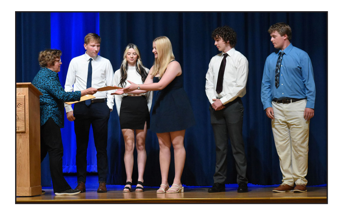
Members of the Class of 2024 receive awards and scholarships at last year's High School Awards Night. This year's Awards Night is on Wednesday, May 14.