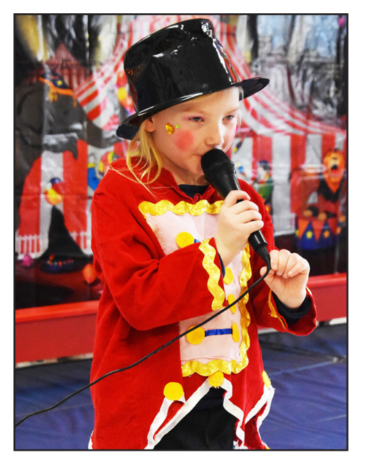
The Pardeeville 4K Circus, held on Friday, March 21, including many different acts, including a singing ringmaster.