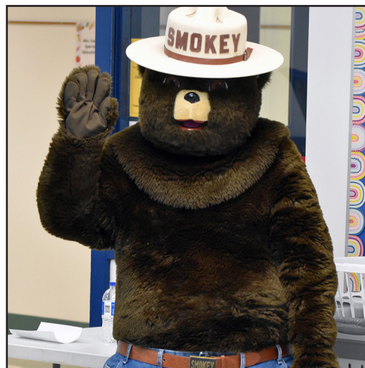
Smokey Bear visited Pardeeville Elementary School to help teach about fire safety.

The event was a highlight of Fire Safety Week, instilling safety knowledge in students in a fun, memorable way.