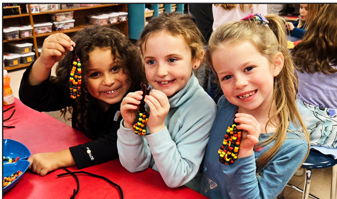
Pardeeville's Family Night on Nov. 14 included a variety of fun activities for all family members.

A heartfelt thank you goes out to all the families who attended and made the evening so special. The success of the event would not have been possible without the dedication and hard work of the teachers, staff, and volunteers who organized and facilitated the night.