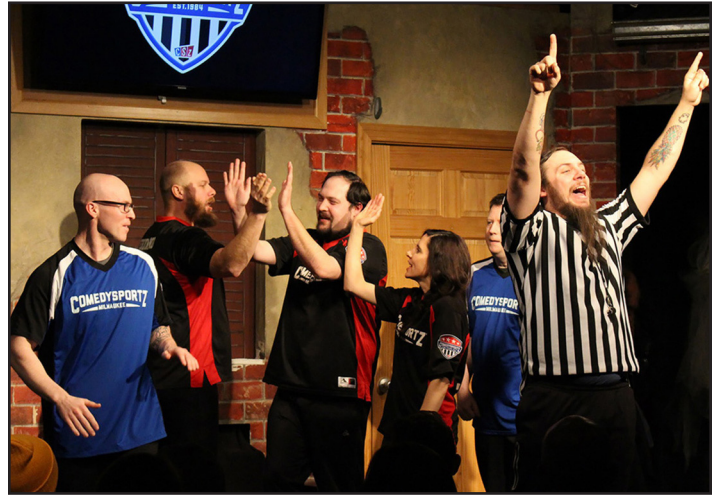
ComedySportz is brining its exciting comedy show to Pardeeville's Lenz Auditorium on Feb. 1.

On Saturday, March 8, Ring of Kerry will be visiting Pardeeville. Ring of Kerry is a bursting-with-energy Irish music group that captures the hearts of listeners. The group takes its name from a beautiful craggy drive in southwestern County Kerry, Ireland. Its Celtic music, however, is played with a heart much closer to its American home.