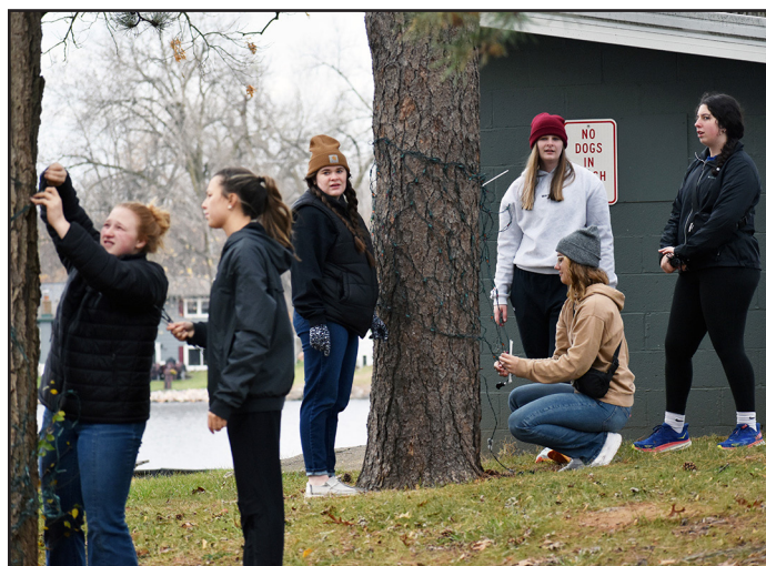
ABOVE: A group of Pardeeville High School students wrap trees with lights in Chandler Park on Saturday, Nov. 9. Over 40 students volunteered their time to set up lights.

The holiday light display, a cherished tradition in the community, is now ready to shine bright for visitors to enjoy throughout the season. Thanks to these hardworking students, and many other community members, Chandler Park is sure to be a magical destination for families and friends.