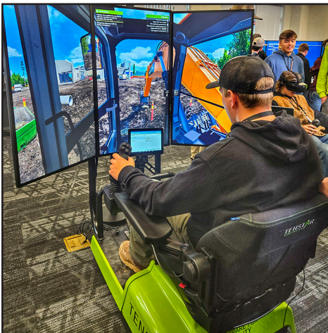
Pardeeville High School students traveled to the Wisconsin Operating Engineers Local 139 Training Center in Coloma.