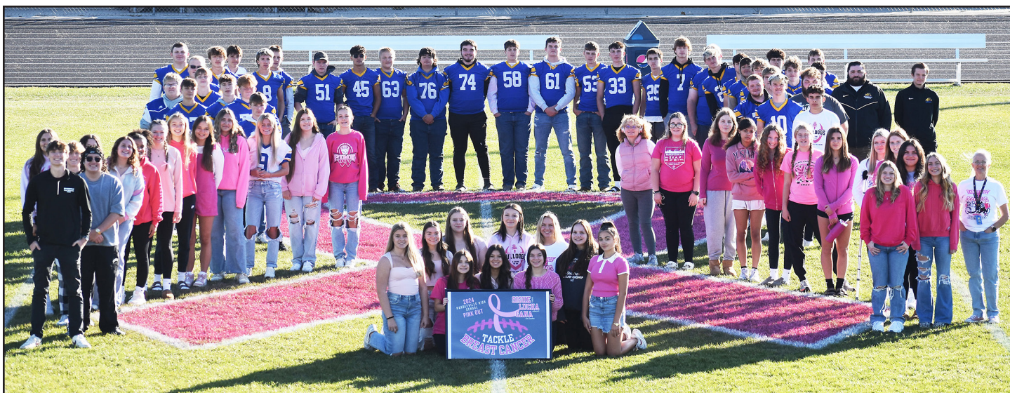
Members of the Pardeeville High School football team poses along with members of the cheer team and Spanish Club in a photo to promote the pink-out football game against Deerfield that was played on Oct. 18.