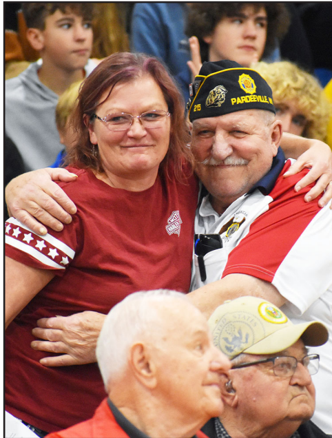
LEFT: Veterans stood and were recognized during the playing of the Armed Forces Medley during the Veterans Day Program held at Pardeeville High School on Monday, Nov. 11.