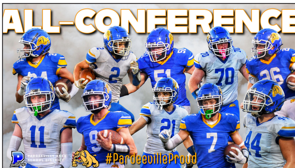
The Pardeeville varsity football team had 10 players earn All-Eastern Suburban Conference honors following the season.