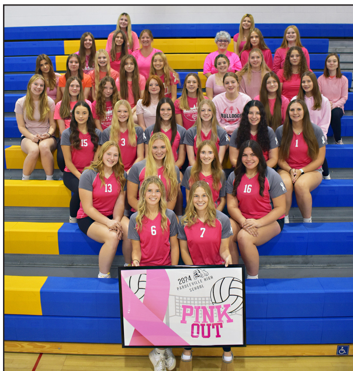
The Pardeeville High School volleyball program hosted a pink-out game against Fall River on Tuesday, Oct. 15.

The funds raised will directly support breast cancer patients through the programs at Prairie Ridge Health, providing much-needed resources and assistance to those navigating their journey.