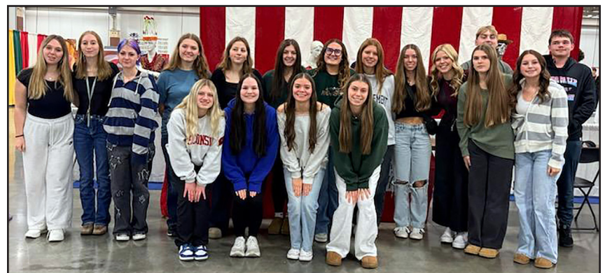
Pardeeville High School Spanish Club members enjoyed the International Folk Fair in West Allis on Friday, Nov. 18.