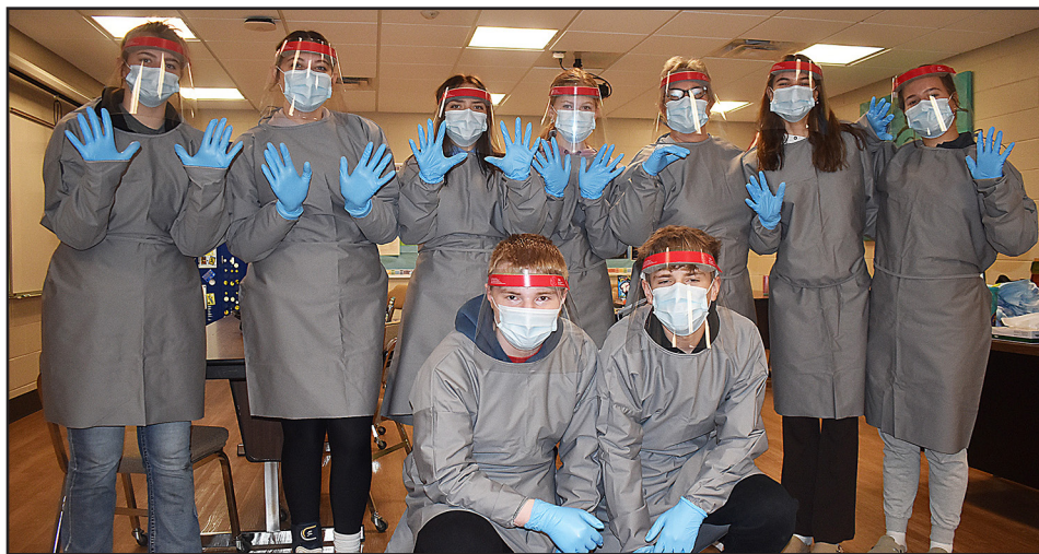
The students in the Intro to Healthcare Careers class at Pardeeville High School gather for a photo after trying on full personal protective equipment. The class is designed to teach students about the different medical professions.

As communities across the country face growing shortages in the health-