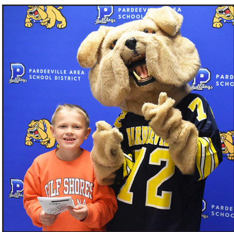
LEFT: Many kids enjoyed visiting with Barney the Bulldog during the Fall Family Night held on Nov. 18 at Pardeeville Elementary School