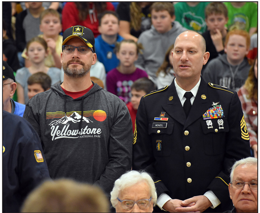
ABOVE: Veterans stood to be recognized during the Veterans Day Program at Pardeeville High School on Nov. 11.

The Pardeeville Area School District extends its heartfelt gratitude to all veterans for their service, sacrifice, and dedication to protecting our freedom.