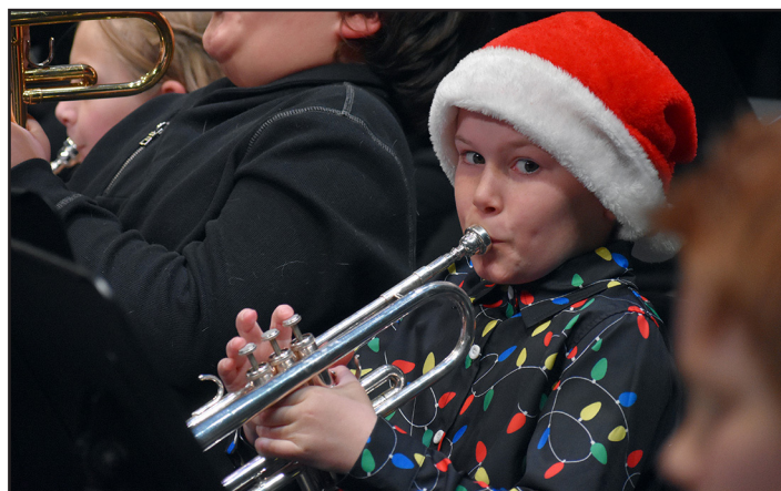
Pardeeville Schools will host four different winter concerts during the month of December in the Lenz Auditorium.

The Pardeeville High School Show Choir will host its