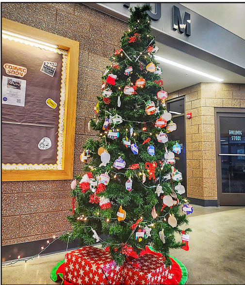
The Pardeeville High School Student Council Giving Tree is on display in the high school atrium. It includes gift tags for area families in need.