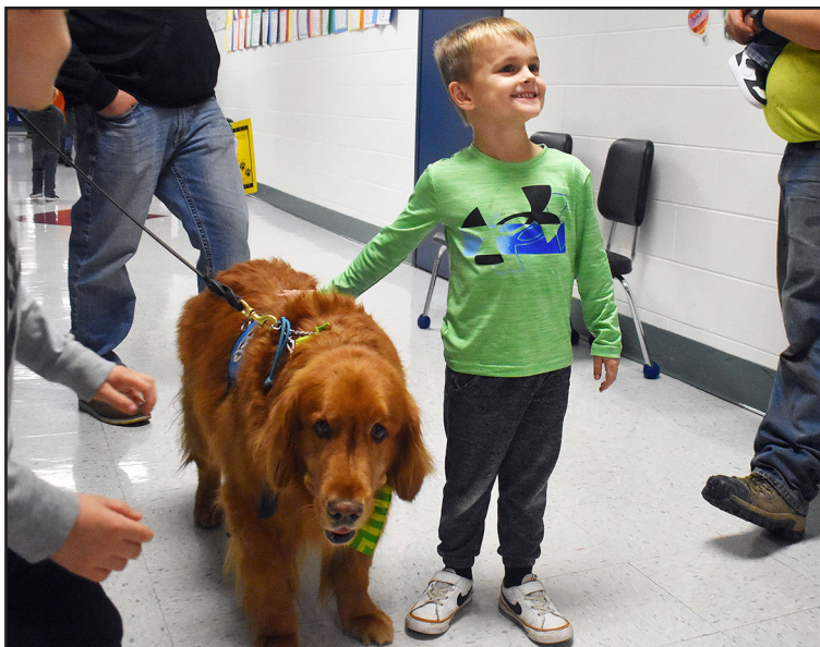
ABOVE: The therapy dogs were a huge hit for everyone at the Fall Family Night at Pardeeville Elementary School.

A special thank-you goes to Thee Upper Crust for providing delicious pizza for families to enjoy during the event. Pardeeville Elementary School extends its gratitude to the dedicated staff members who planned and hosted the evening, as well as to the many families who joined in making “Who Let the Dogs Out?” a joyful and memorable night for all.