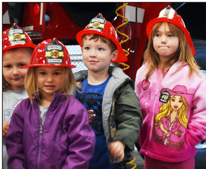
Pardeeville Elementary School 4K students wear their helmets while visiting the Pardeeville Fire Station during a walking field trip on Thursday, Oct. 9.

A big thank you goes out to the Pardeeville Fire Department for helping our students learn how to stay safe — and for making Fire Safety Week such a fun and educational experience.