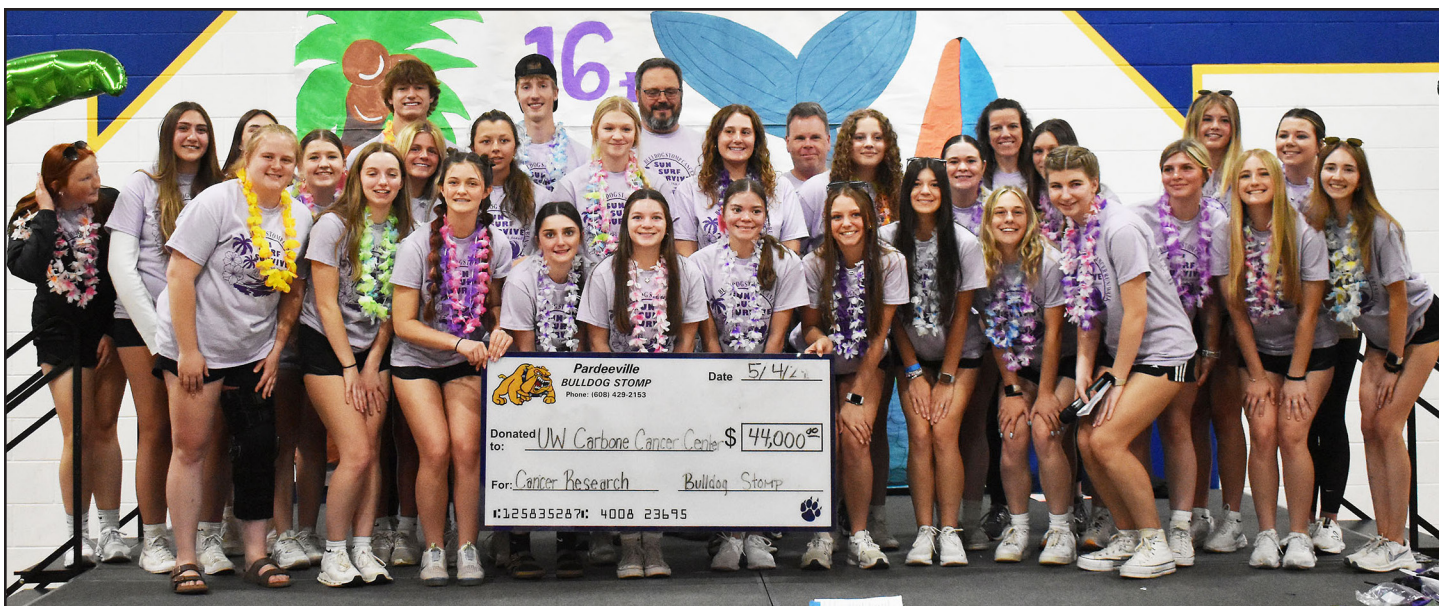
ABOVE: Members of the Bulldog Stomp organizing committee pose for a photo following the completion of the event. This year's Bulldog Stomp raised $45,000 dollars, a new record amount. BELOW: Competitors take off at the start of the 5K race.