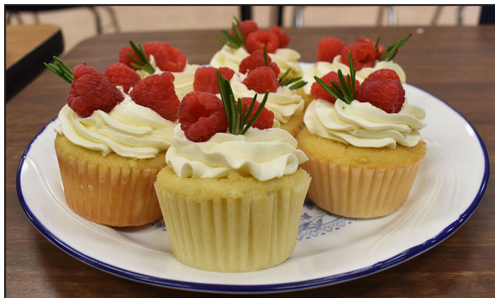
Pardeeville's Advanced Culinary students made some awesome looking and great tasting cupcakes during their annual Cupcake Wars held at the end of the school year.