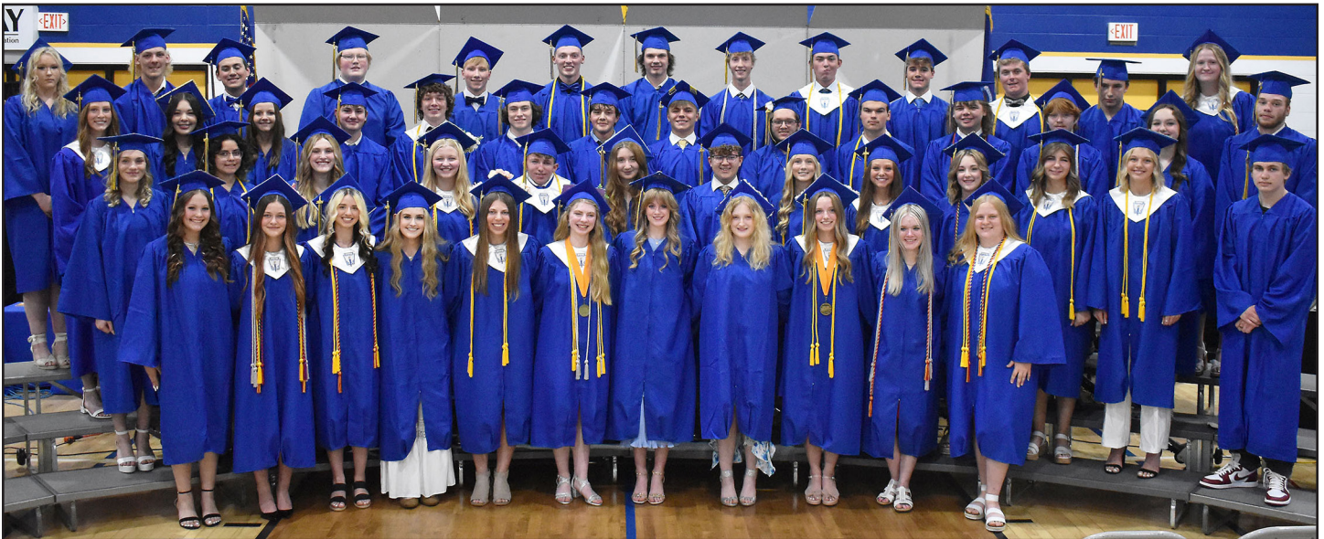
Members of Pardeeville's graduating class of 2024 gather for a group photo during their graduation ceremony held on Saturday, May 25 at Pardeeville High School.