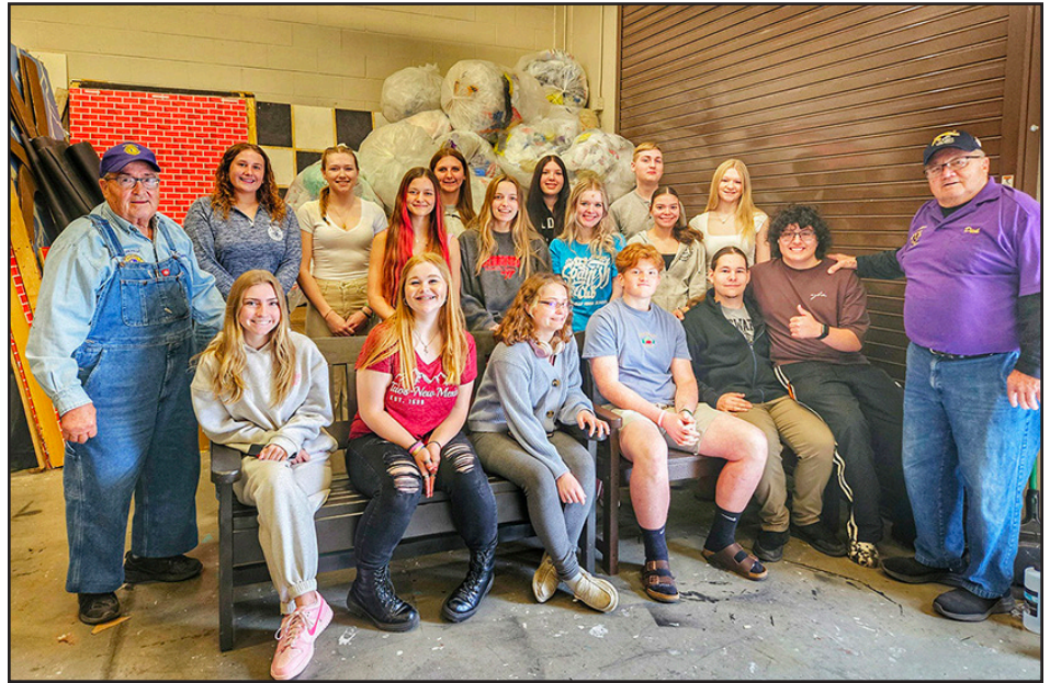
Members of the Pardeeville High School Spanish Club and the Pardeeville Lions Club pose in front of the 354 pounds of plastic they helped collect during the month of April.

In a heartening gesture of appreciation, the Pardeeville Lions Club