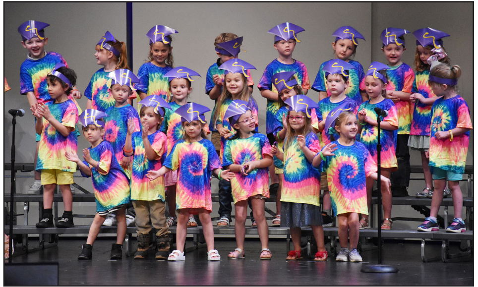
Pardeeville 4K graduates sing and dance on stage during their 4K graduation ceremony held in the Lenz Auditorium on Friday, May 31.

Each student then proudly received a 4K diploma, signifying the hard work and growth they have achieved. The presentation of diplomas was met with cheers and applause, reflecting the supportive community surrounding these young learners.