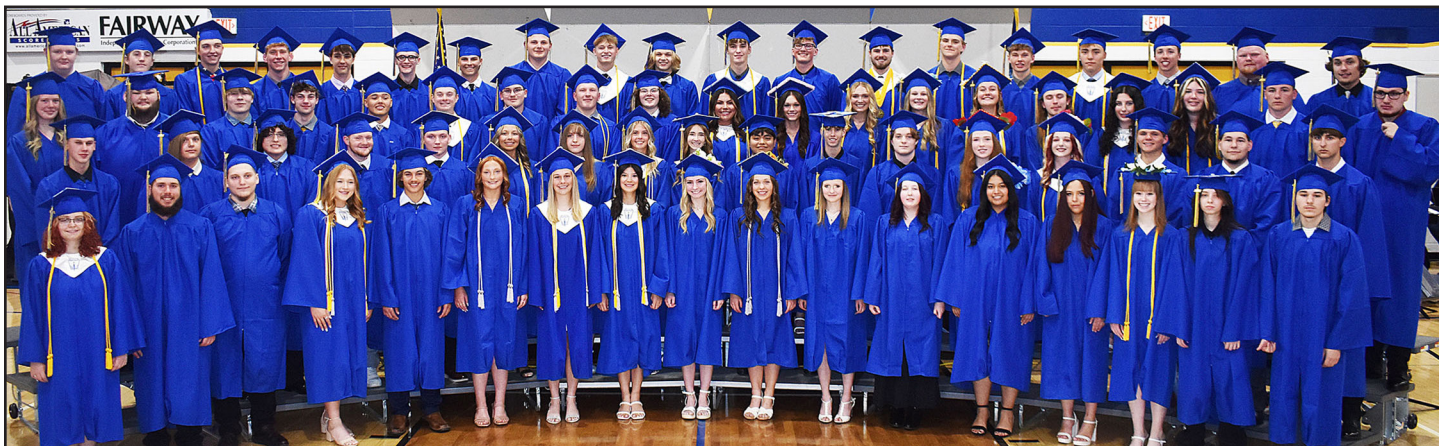
Members of Pardeeville's graduating class of 2025 gather for a group photo during their graduation ceremony held on Saturday, May 24 at Pardeeville High School.