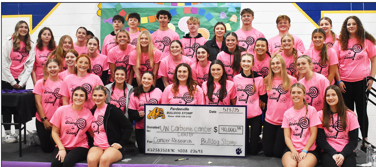
Members of the 2025 Bulldog Stomp Organizing Committee pose with a check for $40,000 that was raised during the 17th annual event that was held on Saturday, May 3 at Pardeeville High School.