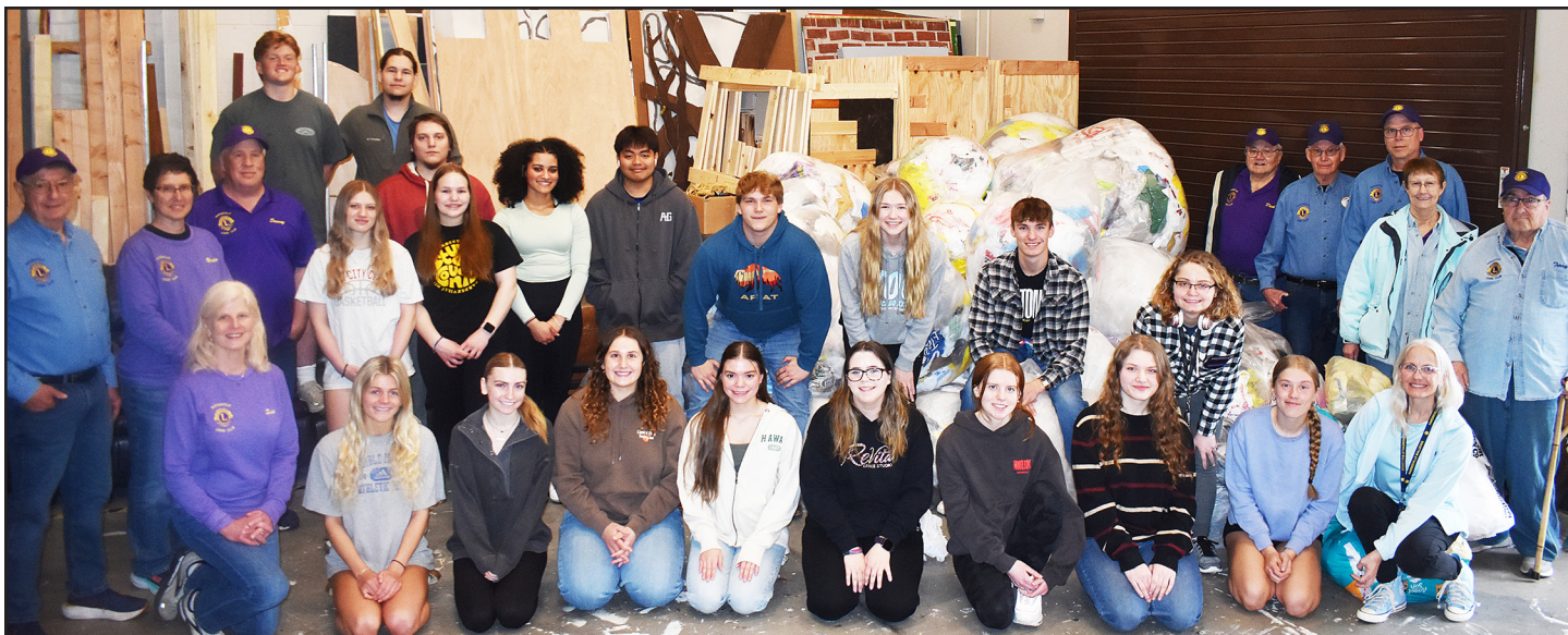
Members of the Pardeeville High School Spanish Club pose with the 320 pounds of recyclable plastic it collected and handed over to the Pardeeville Lions Club on April 25.