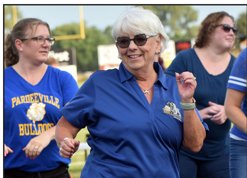
Pardeeville's alumni cheerleaders perform during last year's Alumni Cheer Night.