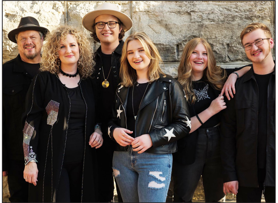
Rockland Road will open the 2025–2026 Performing Arts Series on Friday, Aug. 15 at the Lenz Auditorium. The show will start at 6:30 p.m.

Kick off the season with a powerhouse of harmony! Rockland Road brings generations of musical talent together in one high-energy, vocal-driven band. From classic country roots to pop-rock flair, their electrifying live performance is one you won't want to miss. Rolling Stone hails them as "exuberant!"