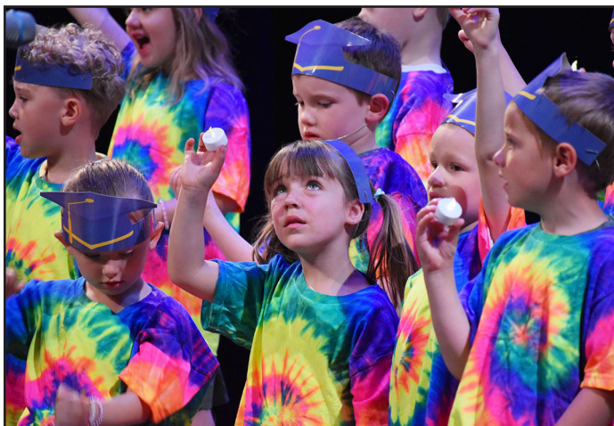
Pardeeville Elementary School 4K students sing "This Little Light of Mine" during the 4K graduation ceremony held in the Lenz Auditorium on June 3.

The ceremony was a joyful and meaningful milestone for students and families alike. Congratulations to all of our 4K graduates—we look forward to seeing all the amazing things you will do as you continue your Bulldog journey.