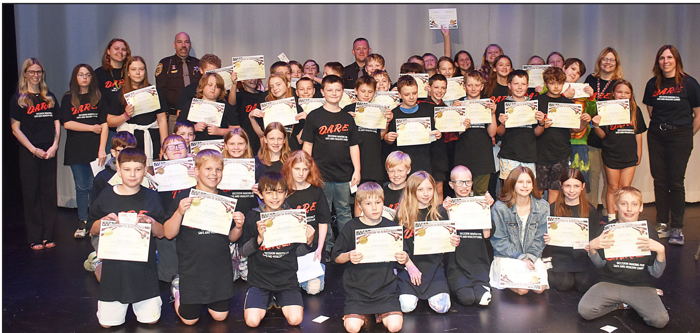
Pardeeville Middle School 5th grade students who graduated from the D.A.R.E. program on May 29 pose for a group photo.