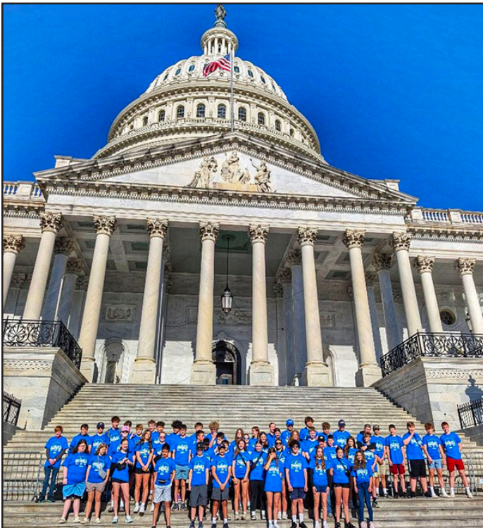
Pardeeville Middle School 8th grade students pose for a group photo outside the U.S. Capitol in Washington D.C. during their field trip in early May.

Thank you to the staff, parents and chaperones who helped create this meaningful learning experience.