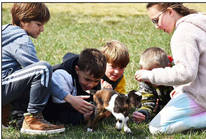
The baby goats was one of the highlights of the Ag Day Event.

Congratulations to all members for a remarkable year, and best wishes to the new officer team as they lead the chapter into another year of learning, service, and success.